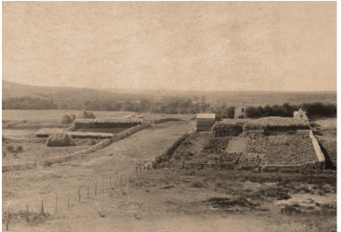
A historic photograph of the farm.