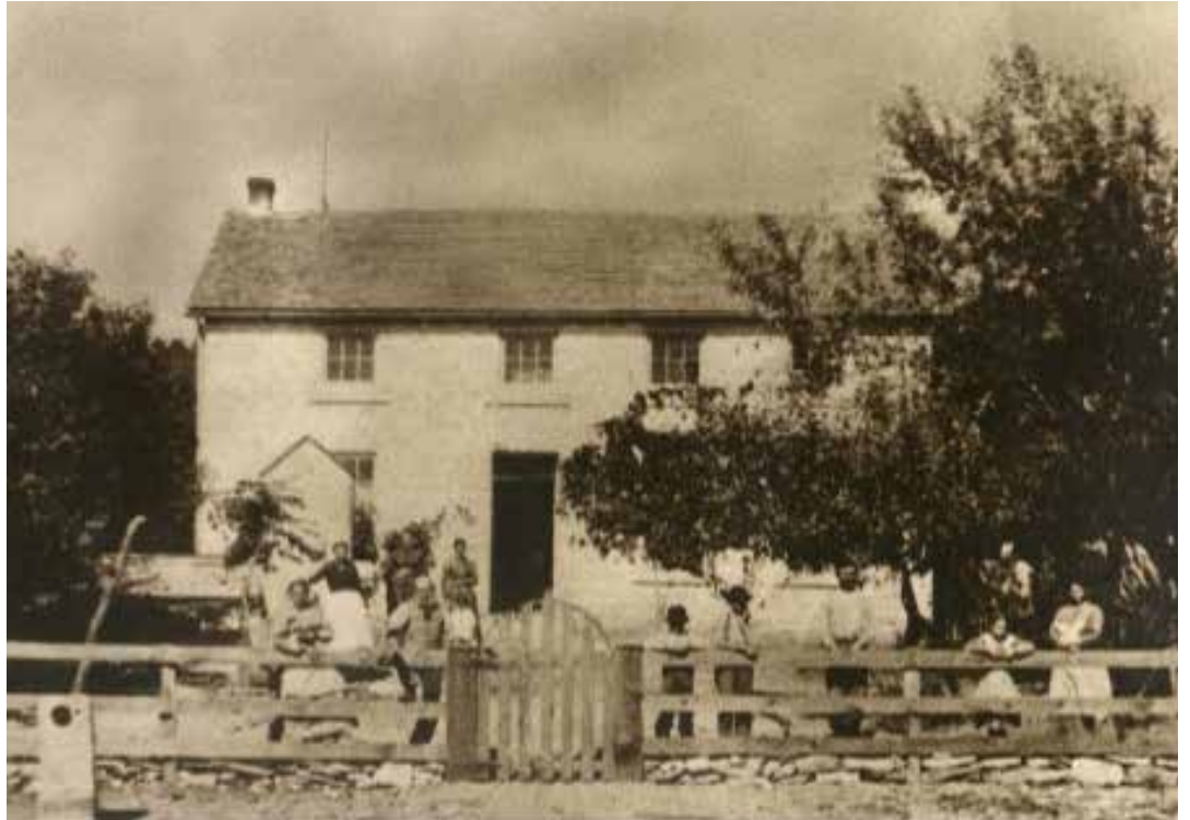
This picture of the old Nehring house includes my great-grandparents and great-great grandparents. The house is not presently owned by a family member.